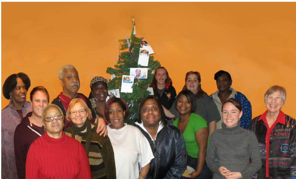
The Christmas tree is adorned for Thanksgiving, with photos of Benedict Center women and staff with their notes of gratitude for what each is thankful.

Rational Justice is a publication of the Benedict Center.