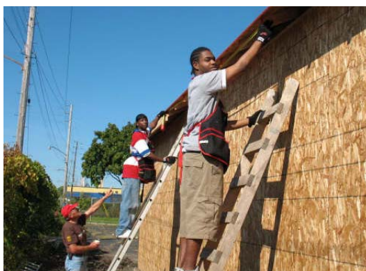
Men from the CJRC working with Habitat for Humanity and in Alice's Garden.